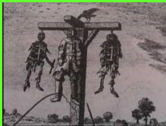
Hanging a Body in Chains