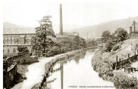
Remains of Grange (Mytholmroyd) mill (bottom left), with Four Day Work (West Field) mill (top left)

LUDDENDEN CONSERVATION SOCIETY, CHARITY NUMBER 504387