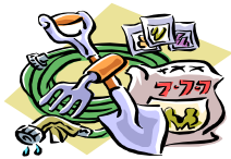
Gardening tips for September

Keep deadheading and feeding your tubs, planters and things like dahlias to prolong the season. Pinch out the growing tip of your tomato's as it is unlikely any fruit that sets now will ripen. Dig up and store your main crop potatoes and bearing in mind what you have planted before in your veg patch plant spring cabbage and autumn onions sets. While the weather is still warm your runner beans will keep producing so keep harvesting them and blanche and freeze any excess. September is the time to plant new perennials and collect seed from your favourite plants for next year. Start cutting back perennials that have flowered and keep on top of the grass mowing. Start looking out for spring bulbs and plants.