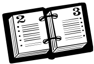
Dates for the diary

Thanks to everyone who have placed items on the table. As summer progresses hopefully more excess fruit and veg grown by villagers will be available so keep checking when you pass.